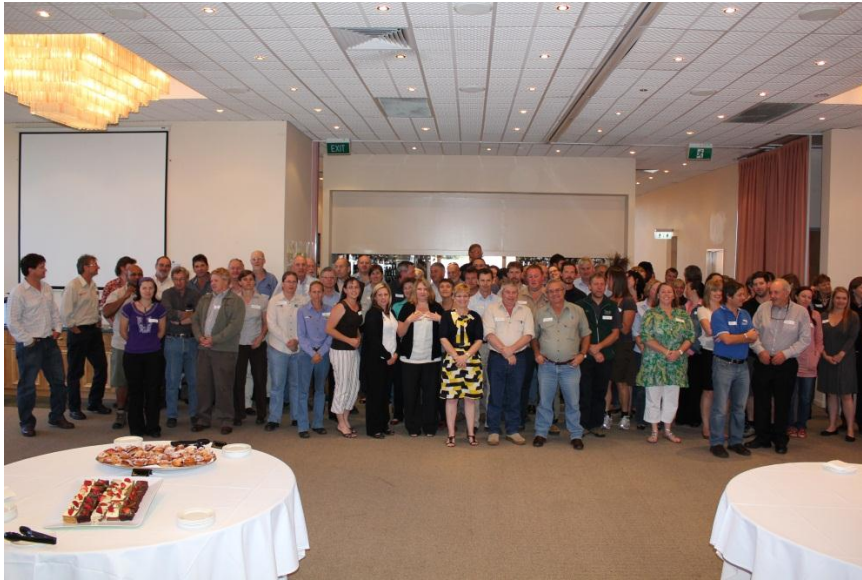
CfoC Funded Regional Landcare Facilitators from the 56 NRM regions across Australian in Melbourne in November.

For the contact details for the RLF in your region go to: http://www.nrm.gov.au/contacts/landcare.html#regional .